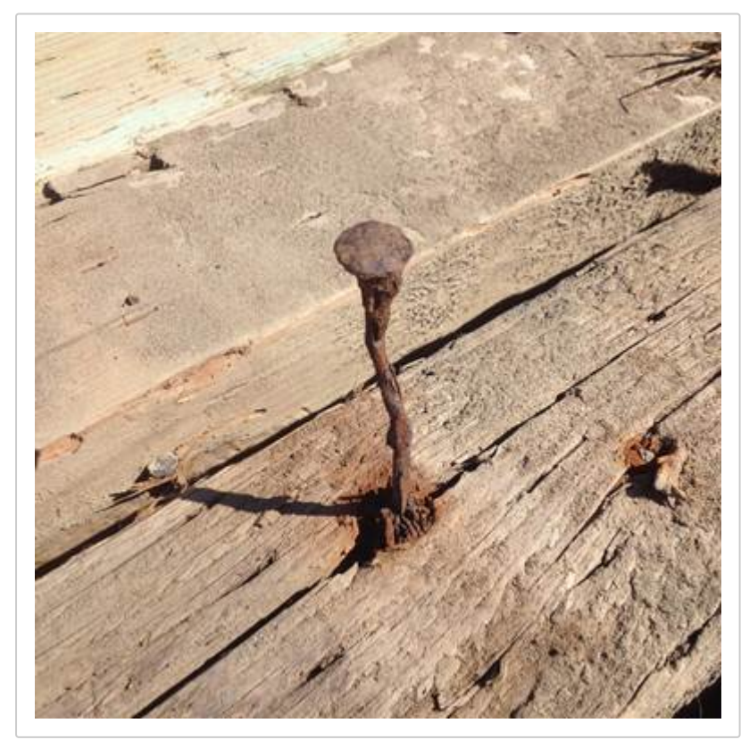
Corroded spike for deck board fastening.

Traditionally, the deck boards have been attached with hot-dip galvanized 60d (0.283" x 6") spikes. However, spikes have a low withdrawal resistance, are typically predrilled and have a multi-step installation process. In addition, spikes, over time, can begin to back out so that the heads protrude above the top of the deck boards. This creates an unsafe condition for pedestrians and also results in ongoing maintenance work. Here you can see one of the old spikes.