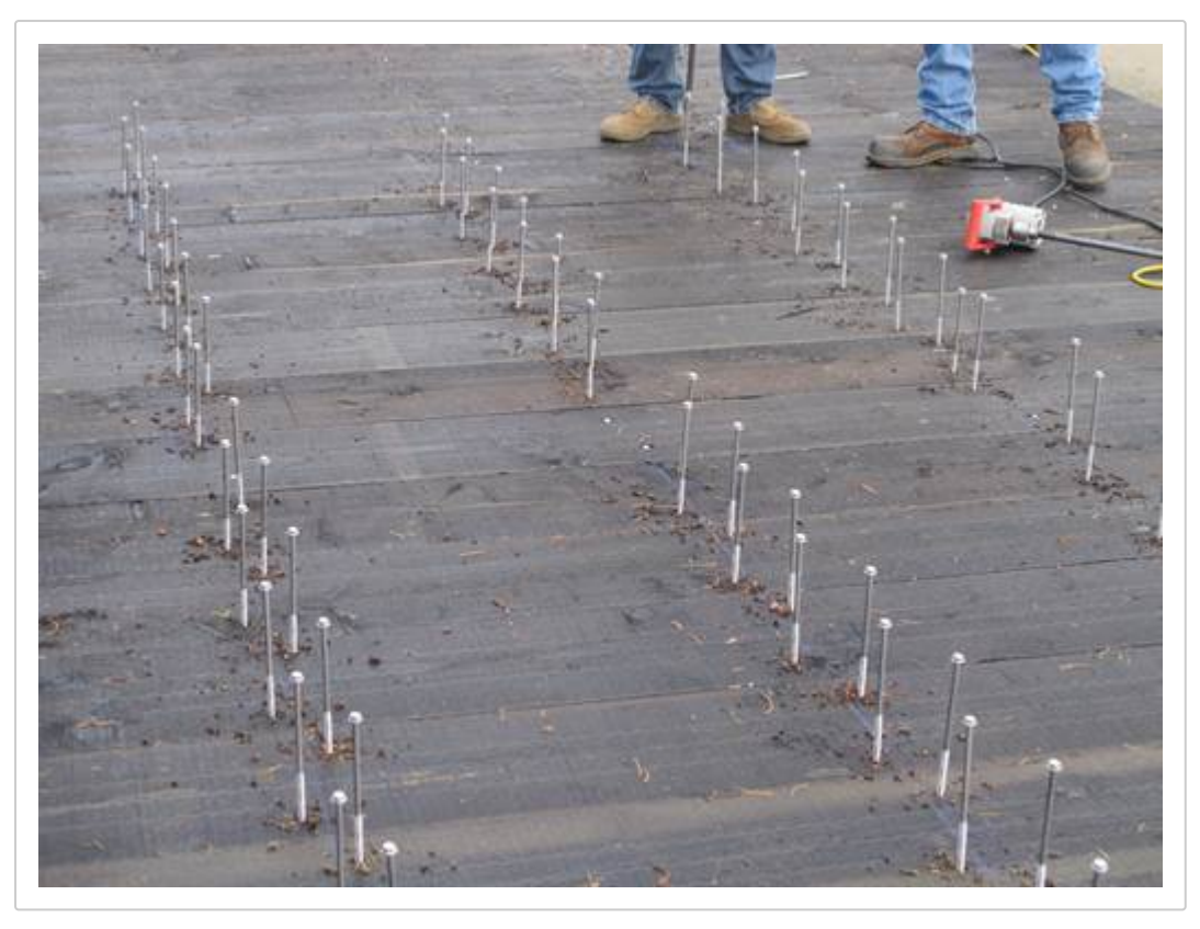
This picture shows the deck fastening in progress. The screws are set and ready for driving with screw-driving tools.

alternate. In addition, it provided better withdrawal and lateral load values than the spikes.